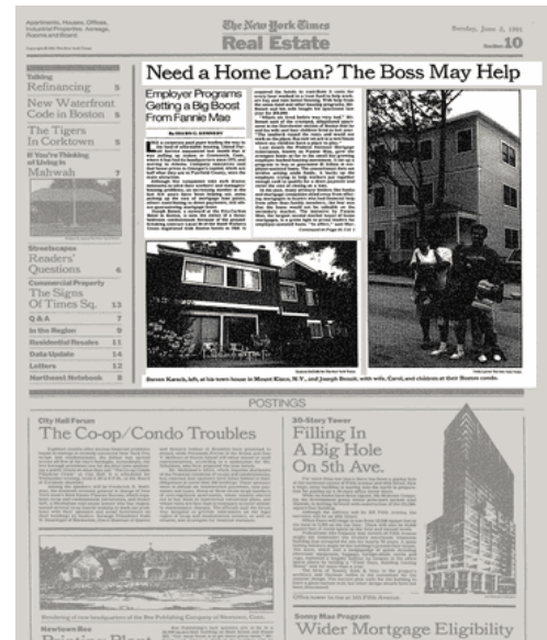
New York Times, June 2, 1991, "Need a Home Loan? The Boss May Help", highlighting Fannie Mae's first EAH downpayment assistance program.

Payroll savings matches are commonly offered by employers for a variety of employee costs. Employers can utilize payroll savings matches to provide an incentive and financial assistance to employees saving for homeownership. Many workers have difficulty establishing a saving plan. A payroll savings match program directs a predetermined portion of the employee's paycheck into a special account which helps build "automatic" savings for the employee. As an incentive to employees to sign up for the savings program, an employer can promise to match the employee's savings for home purchase. Employers may choose to work with the employee to set a goal amount for the employee savings and provide the match once the amount is saved in the account. Although a taxable benefit to the employee, this can help accumulate more savings.