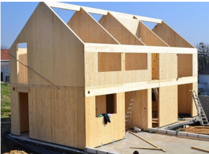
An example of BentPack construction, photo courtesy of Mass Kingdom.

The design and cost innovation aspect of the project is a key strength, as mass timber kits would be a new housing typology for rental housing in Vermont. Fairbanks Museum is currently using mass timber in the construction of an addition to the museum, which will serve as a demonstration project for the state. The Delta Campus project team expects to move forward with additional mass timber designs for a mix of homeownership and rental units moving up the spine of the campus. Having a budget that includes only owner equity and debt will allow the initial pilot project to move forward quickly.