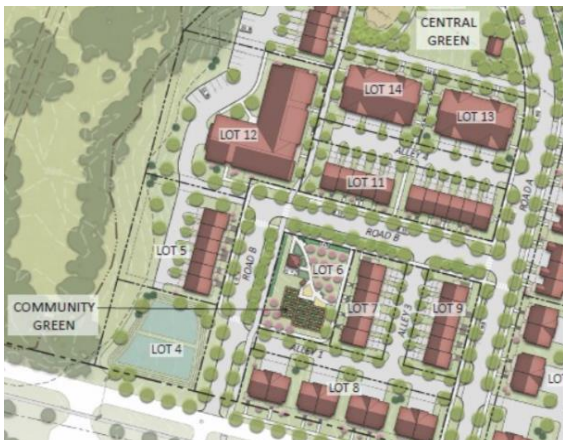
Segment of site plan for Stonecrop Meadows

The project has received $25 million in funding assistance thus far from multiple sources. The Vermont Housing Finance Agency (VHFA) has allocated about $8 million in grant funding to help subsidize the cost of construction and facilitate the affordability of the new homes for average income households and awarded Low Income Housing Tax Credits that will generate about $9 million in equity. The Middle-Income Homeownership Development Program funding will help to support construction of 35 homes for sale with prices affordable to buyers with incomes at or below 150% of the area median. In addition, a $1.25 million Community Development Block Grant has been secured for infrastructure costs in the new neighborhood, further minimizing the construction costs. The development team is continuing to actively pursue available grants for future phases of the project.