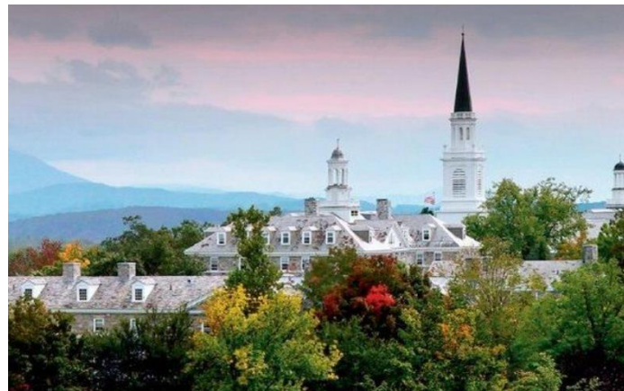
Middlebury College, Porter Hospital, and National Bank of Middlebury recognized the need for more affordable housing for employees and community residents.