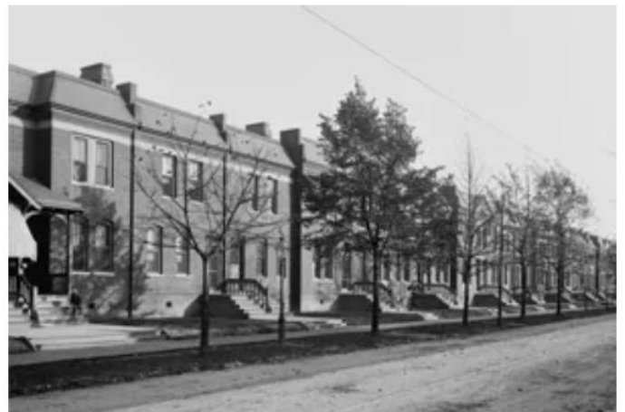
Pullman worker homes south of Chicago, ca 1890.

By providing access to affordable housing options for employees close to where they work, employers can improve their ability to attract needed talent and retain existing employees thus boosting their bottom line. There are a variety of approaches to EAH and numerous potential partnership and collaboration strategies.