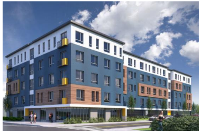
Rendering of Lake and Maple building. Courtesy of Grant Butterfield/Jutras Architecture

As of 2023, NEFCU is the largest single Vermont investor in the fund to date. The Lake and Maple building in St. Albans is an example of the projects supported through VHIF. This 72-apartment building continues the city's ambitious community revitalization efforts. Lake and Maple will fill a currently empty downtown lot, remediating a brownfield site. It is within walking distance to schools, public transportation and amenities and is near several major employers. All apartments will serve low-income households at or below 60% of area median income. Eleven on-site apartments will serve formerly homeless households, paired with supportive services. The apartments are a mix of studios and 1, 2, and 3-bedroom apartments to serve a range of household sizes. The building includes a ground floor common area and a co-working space for tenants. The project meets the Efficiency Vermont High Performance standards, which aims for energy efficiency exceeding standard building codes from the building design through the equipment and systems, substantially reducing future energy costs. Four apartments will be fully ADA accessible while all other units will be visitable/adaptable.