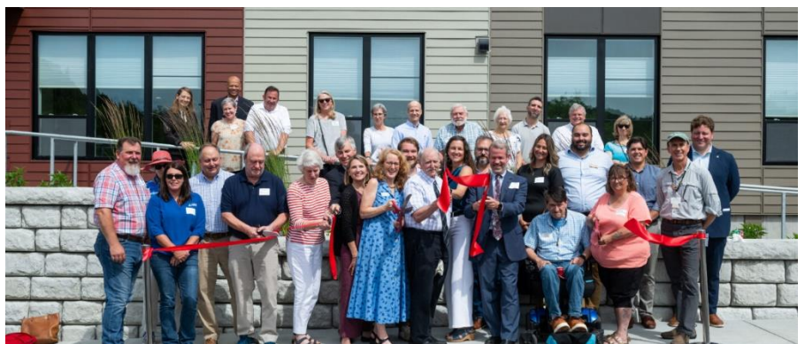
Riverwalk Apartments which opened in June 2024 is the first development funded by the Upper Valley Loan Fund.

The Upper Valley region will need to triple the current annual rate of housing production to meet the estimated 10,000 new homes needed to meet demand by 2030, according to the Keys To the Valley Housing Needs Forecast . The Upper Valley Loan fund will help to accelerate and sustain housing creation, expanding the available supply. The additional homes produced by this fund will supplement the existing homes that are affordable to households earning below 80% area median.