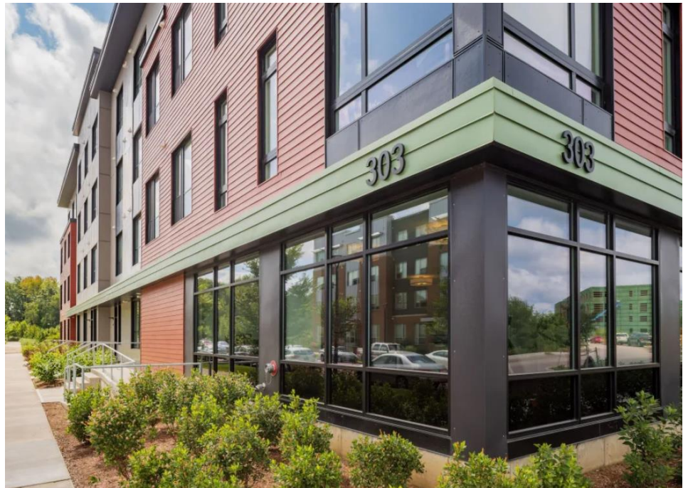
303 Market Street Apartments in South Burlington's City Center

The UVM Health Network catalyzed the housing development by offering project financing to experienced development and property management partners to construct and manage the project. The Health Network will own 49% of both apartment buildings and holds a 10-year master lease of the apartments and childcare center, with the option to renew. Employees including nurses, licensed nursing assistants, technical workers, environmental services, nutrition services, patient support and facilities team members currently occupy apartments at 303 Market Street. The overall project will help the Health Network reduce the expenses of using high-cost temporary travelling staff while maintaining the services needed to meet health care needs of patients.