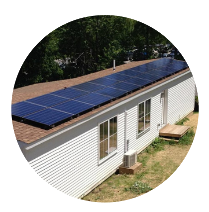
Vermod high-efficiency manufactured home