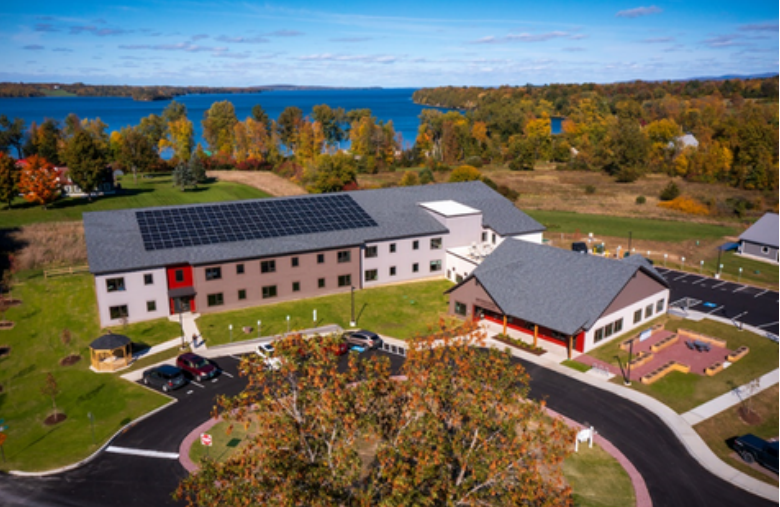
St. Johnsbury House