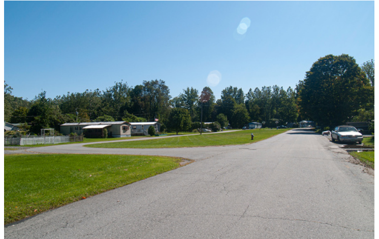
Tri Park in Brattleboro

Tri-Park is Vermont's largest manufactured home community, with 306 households. With nearly 1,000 residents, the community houses almost 10% of Brattleboro's population. Tri Park has been organized as a resident-owned cooperative since 1989. Spread over three sites, one of the three is at very high risk for flood damage. This past year, VHFA awarded state tax credits that will provide 33 resident households with highly energy efficient new manufactured homes at safer locations within the community. The old sites will be converted into conservation easements.