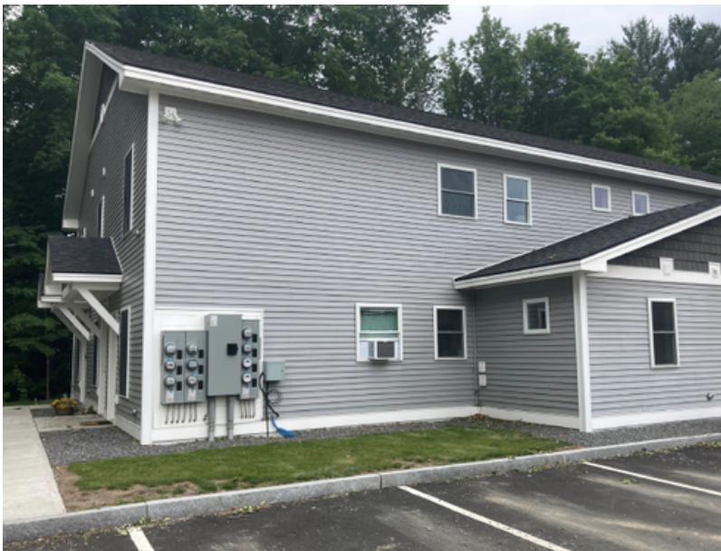
Photo of the completed building at Gordon Lane.

All Bayview Crossing tenants will have access to SASH (Support and Services at Home), a care-coordination program that helps residents live safely and independently. Bayview also strengthens community ties through a commercial space with an office for Champlain Islanders Developing Essential Resources (CIDER), a local nonprofit offering transportation, meals, and other services to island residents.