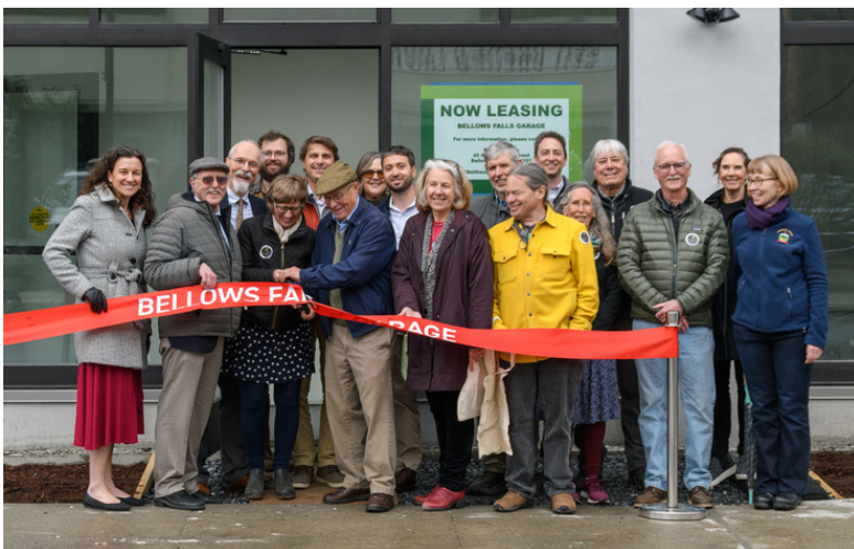
Bellows Falls Garage ribbon-cutting in April.

The building is in downtown Bellows Falls, walkable to jobs and amenities, with beautiful views of the Connecticut River. It includes 27 mixed income studios, 1, and 2-bedroom apartments with a commercial space on the ground floor.