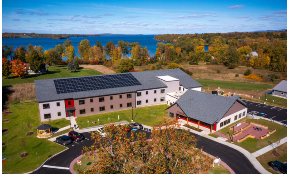
Aerial view of Bayview Crossing.

All Bayview Crossing tenants will have access to SASH (Support and Services at Home), a care-coordination program that helps residents live safely and independently. Bayview also strengthens community ties through a commercial space with an office for Champlain Islanders Developing Essential Resources (CIDER), a local nonprofit offering transportation, meals, and other services to island residents.