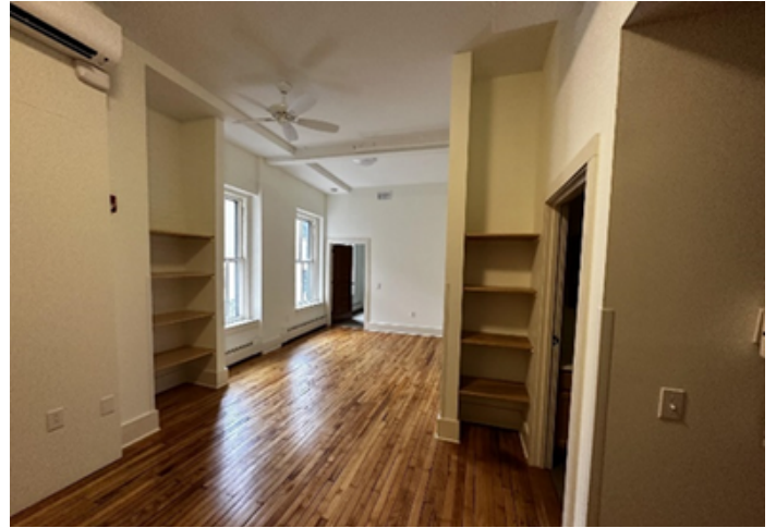
Apartment interior, Tuttle Block in Rutland

A keystone building in downtown Rutland since 1832, the rehabilitation of Tuttle Block is nearing completion as of May 2023. The project, sponsored by the Housing Trust of Rutland County, expanded the number of residential units from 13 to 16, and substantially improved the first-floor commercial space. A $175,000 VHIF investment provided very low cost debt that served as the last “but for” source that the project needed to move forward. Units began occupying in May and the commercial space is receiving final touches.