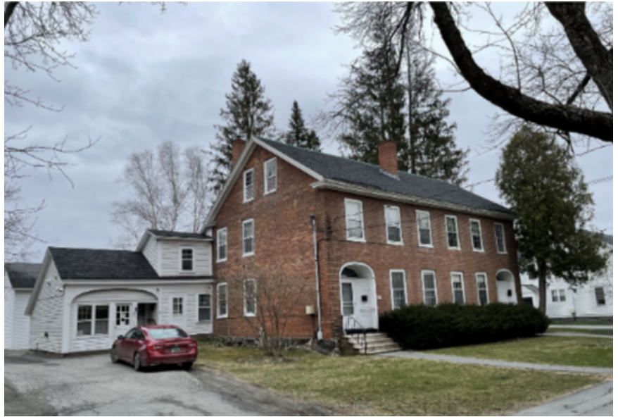
Mellishwood Apartments.

This project offers an opportunity for a mission-driven nonprofit to preserve existing housing opportunities and eventually convert the property to permanent affordability. Twin Pines plans to use the two-year loan term to create a plan to improve the health and safety conditions and energy efficiency of the property and apply for tax credits from VHFA to support its redevelopment.