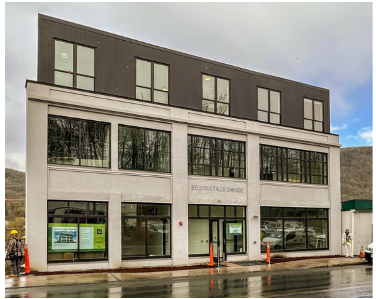
Bellows Falls Garage as it neared completion.

Originally, the project sponsor, Windham & Windsor Housing Trust (WWHT), had planned to rehabilitate the existing 100-year-old structure, which had fallen into deep disrepair. However, work on the project revealed that the building had significant structural issues. The entirely new, highly energy-efficient building recreates the historic façade that has long served as a gateway to the village downtown.