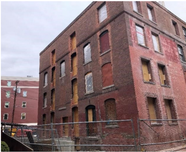
DeWitt Building in Brattleboro, prior to redevelopment