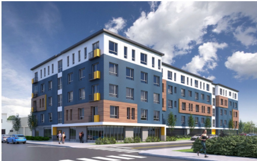
Rendering of Lake and Maple building. Courtesy of Grant Butterfield/Jutras Architecture

All 72 units will serve low-income households at or below 60% of area median income. Eleven on-site units will serve formerly homeless households, paired with supportive services. The apartments are a mix of studios and 1, 2, and 3-bedroom apartments to serve a range of household sizes.