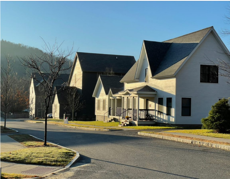
A duplex in the Safford Commons neighborhood in Woodstock. The second phase of the project received an award from the Missing Middle program.

In March, the VHFA Board of Commissioners awarded $14.2 million to support 92 homes in 12 projects as part of the Missing Middle-Income Homeownership Development Pilot Program.