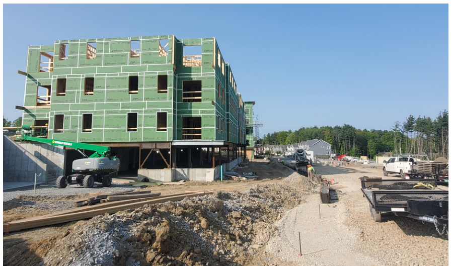
Construction site at O'Brien Farms

The 94 units of new construction in South Burlington's O'Brien Farms, developed by Summit Properties, are moving forward ahead of schedule. The $400,000 VHIF investment was placed in one of the two buildings (47 units) as a construction loan and will convert into permanent debt for the project's final funding stack.